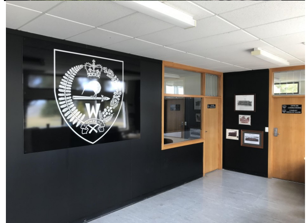
W Coy HQ 1RNZIR Linton Camp