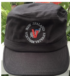
G - Caps Black,Khaki or Charcoal (Veteran): $30.00