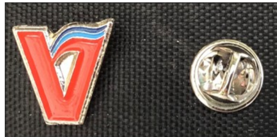
B - Badge Lapel Small Round $5.00