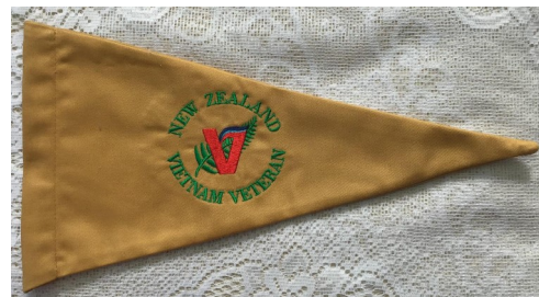
D - Banner Atrial : $20.00