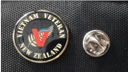
A - Badge Lapel Small Round $5.00